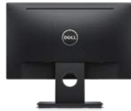
Back view - Cable management slot

Easily adjust the panel to your preferred viewing position.