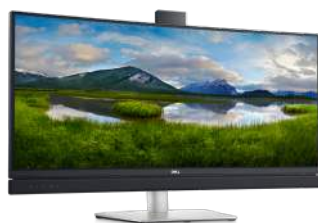
34" Curved Video Conferencing Monitor - C3422WE

Bring your meetings to life on this 34-inch curved WQHD monitor with an integrated IR camera, dual 5W speakers and a dedicated, one-touch Teams button.