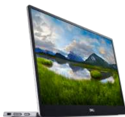
14" Portable Monitor - C1422H

Multi-task seamlessly across 3 devices with this premium full-size keyboard and sculpted mouse combo featuring programmable shortcuts and 36 months battery life. 42