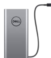
Notebook Power Bank Plus – USB C, 65Wh - PW7018LC

Multiport adapter with integrated speakerphone offers an all-in-one connectivity and conferencing solution.