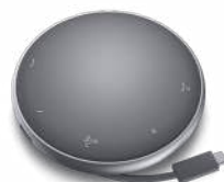
Dell Speakerphone with Multiport Adapter

Experience dual-screen productivity anywhere with Dell's first-ever 14" portable monitor.