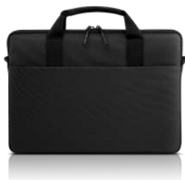
Dell EcoLoop Pro Sleeve (L) - CV5623 (15" models)

Eco-friendly and dependable sleeve to keep your laptop securely protected on the go.