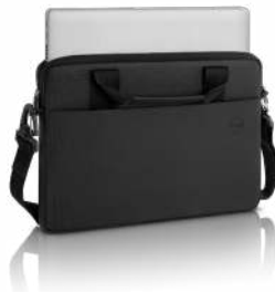
Dell EcoLoop Pro Sleeve (S) - CV5423 (13/14" models)

Eco-friendly and dependable sleeve to keep your laptop securely protected on the go.