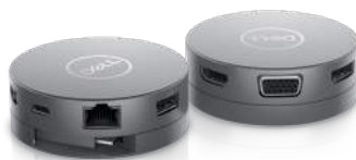
Dell USB-C Mobile Adapter - DA310

Travel light while making a positive impact on the environment by selecting the compact, eco-friendly Dell Premier Slim Backpack 15 (PE1520PS) with EVA foam cushioning to protect your laptop from impact.