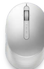
Dell Premier Rechargeable Wireless Mouse - MS7421W

Compact and portable 7-in-1 USB-C mobile adapter provides superb video, data connectivity and up to 90W power pass-through to your PC.