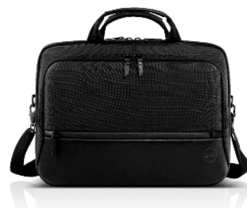
Dell Premier Briefcase 15 - PE1520C

Eco-friendly and dependable sleeve to keep your laptop securely protected on the go.