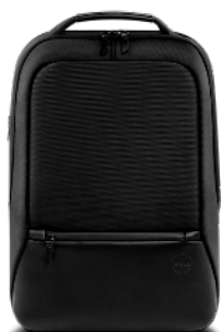
Dell Premier Slim Backpack 15 - PE1520PS

Active Pen with a Tile location tracker providing long battery life on a single charge.